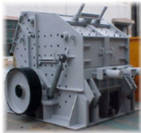
AP 52x60 Impactor