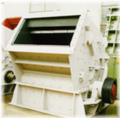
AP 40x52 Impactor