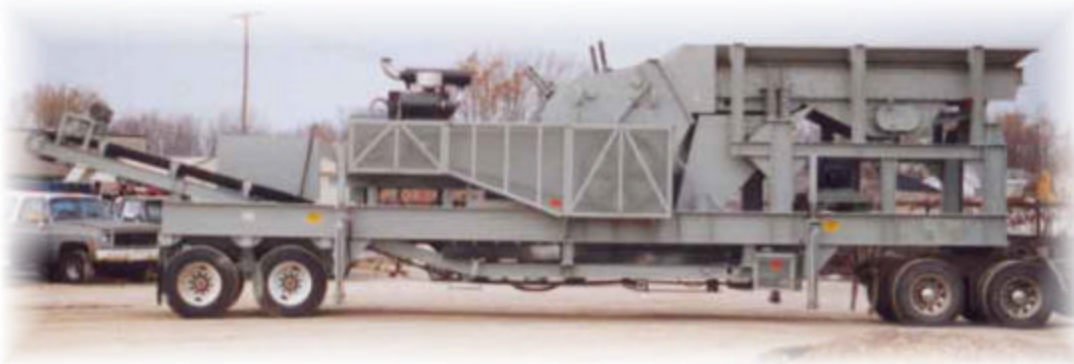
AP4052 Impact Crusher Installed with 46x16 Feeder in Portable Plant Operating in Midwest United States