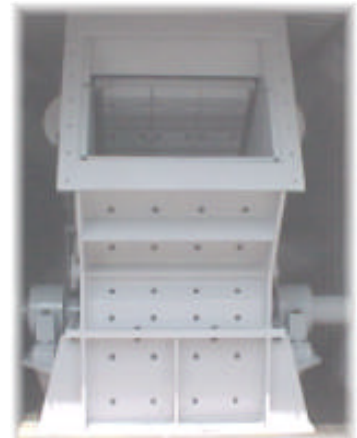
AP 40x30 Impactor